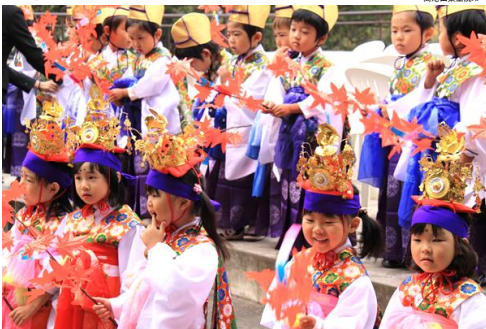
Mt. Takao Spring Festival.