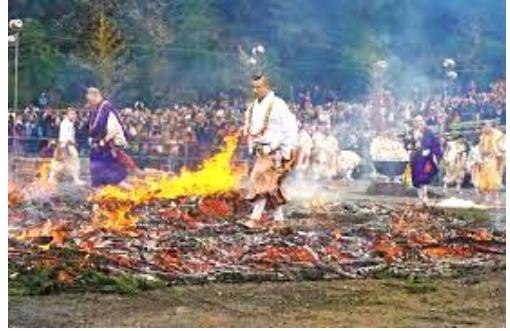
Firewalking Festival at Yakuoin temple in Mt. Takao.