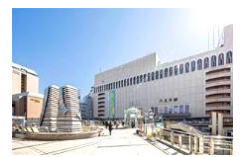
八王子市画像オープンデータ

It became the first city on the outskirts of Tokyo in 1917 , but was devastated by bombing during the war. After the 1960s , with the construction of residential complexes and the universities , the population has exploded, and today it has become a town of culture, tourism and innovation .