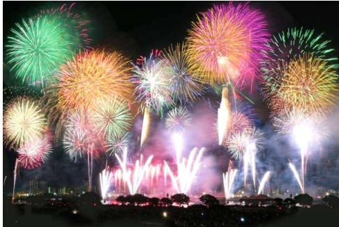
Hachioji Fireworks Festival.