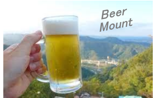
Mt. Takao Beer Mount (beer garden) opens till October.