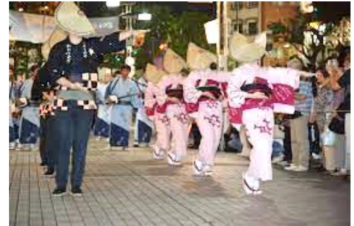
Ecchu-Owara Wind Bon Dance in Hachioji.