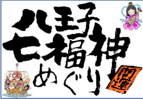
Visiting the Seven(or 8) Gods of Fortune in Hachioji.