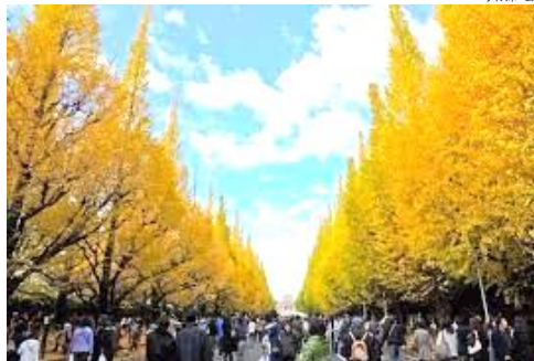
Hachioji Icho(Ginkgo) Festival.