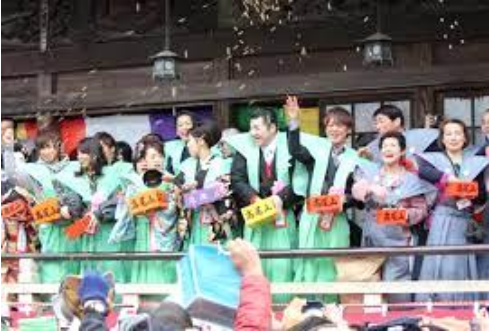
Setsubun Bean-throwing Festival in Mt. Takao.