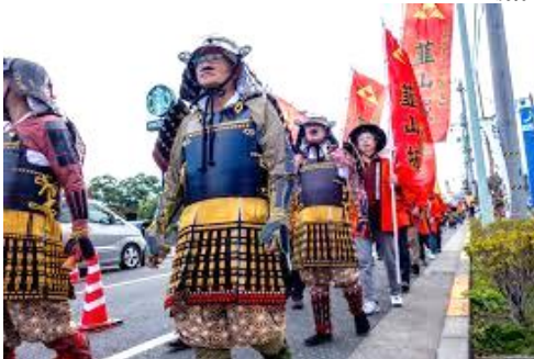
Hojo Ujiteru Festival in Moto-Hachioji.