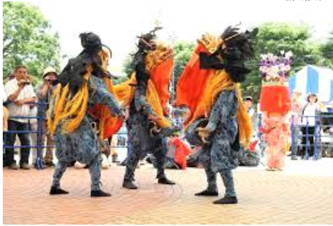
Legendary Tama Traditional Culture Festival.