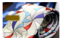
八王子市画像オープンデータ

Hachioji is known as the " City of Mulberries ". Tama textiles, which fall under Hachioji textiles, were named a national traditional craft in 1980. They were also named part of the Japan Heritage " Mysterious Mt. Takao " cultural asset group in 2020. Don't miss the amazing quality of Hachioji textile like neckties, shawls and so on. Visit Hachioji Beneck .