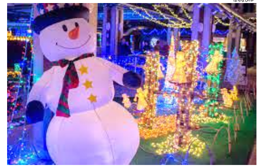
Satoyama Illuminations in Ongata.