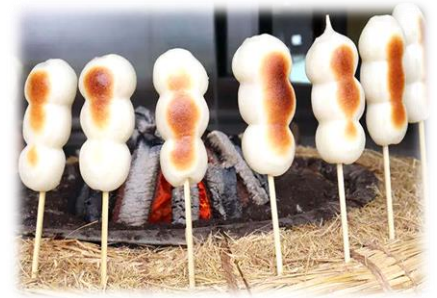
Live Japan HP

Nourishing buckwheat noodles with grated yam.